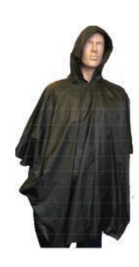
RAIN PONCH RUBBERISED