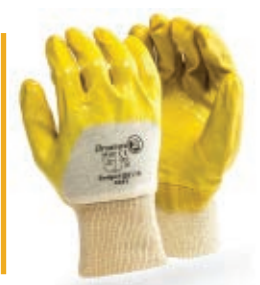
NITRILE PALM COATED GLOVE