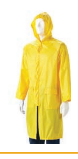
PVC & RUBBERISED RAINCOAT