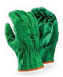
GREEN PARROT GLOVE