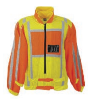
2 TONE REFLECTIVE JACKET SLEEVE DETACHARBLE