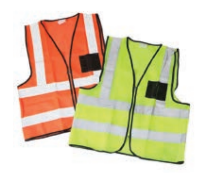
REFLECTIVE SLEEVELESS VEST