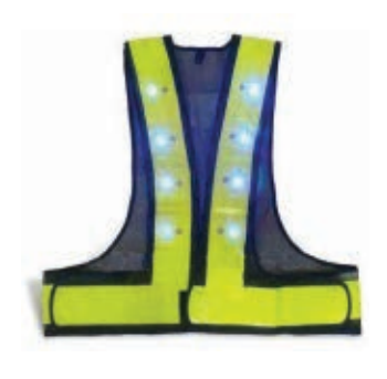
LED SAFETY REFLECTIVE VEST