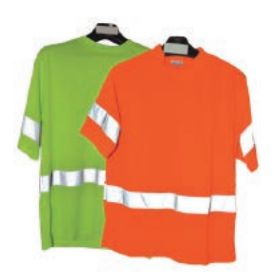
REFLECTIVE ROUND NECK