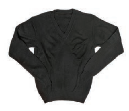
PLAIN LONG SLEEVE JERSEY