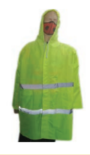
CLASSIC LIME REFLECTIVE RAIN COAT