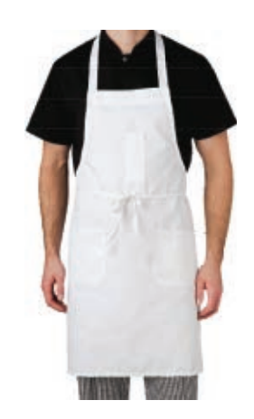
FULL CHEF APRON