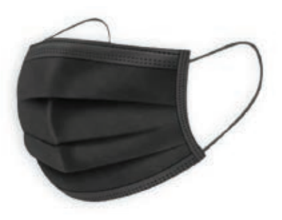
DISPOSABLE 3 PLY - BLACK