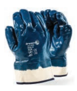
NITRILE FULLY COATED