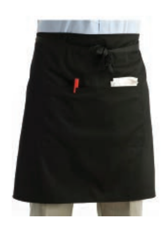
HALF CHEF APRON