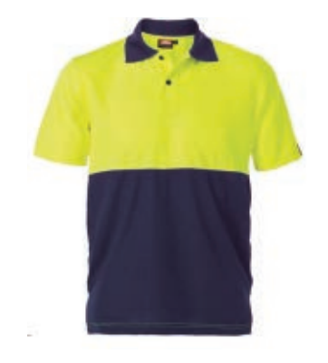
TWO TONE HIGH VIZ GOLFER