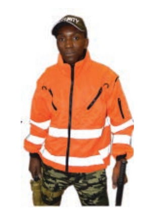
REFLECTIVE JACKETS IN LIME GREEN, ROYAL BLUE & ORANGE

info@nyatisafety.com | +27 727 008 333 | www.nyatisafety.com Price subject to change. Excludes shipping. Custom orders and branding available on request