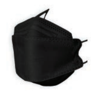
KF94 MASK -BLACK