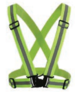
HIGH VISIBILITY REFLECTIVE VEST