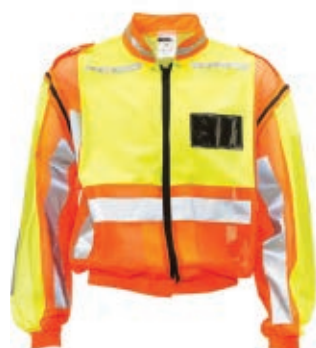
2 TONE REFLECTIVE JACKET NON DETACHARBLE SLEEVE