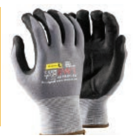
NITRIFLEX COATED GLOVE